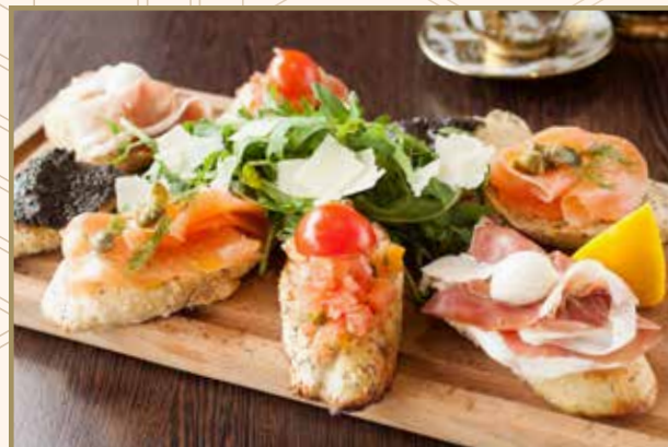
Selection of Bruschetta's