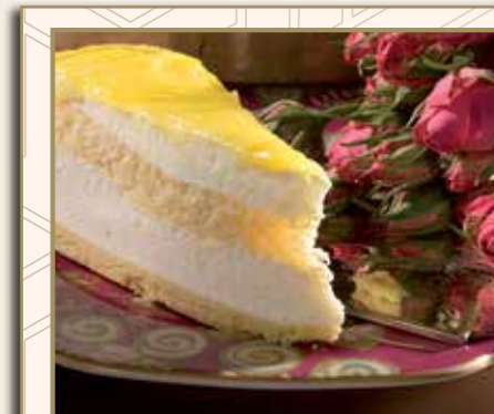
Lemon Cheese Cake