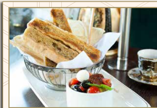
Bread & Olives

Marinated with garlic chilli and rosemary served with Italian bread